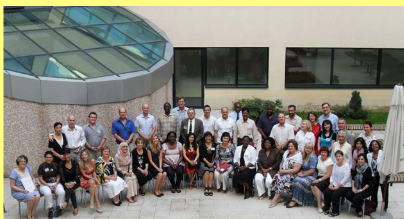
Some participants in a previous BCES Conference